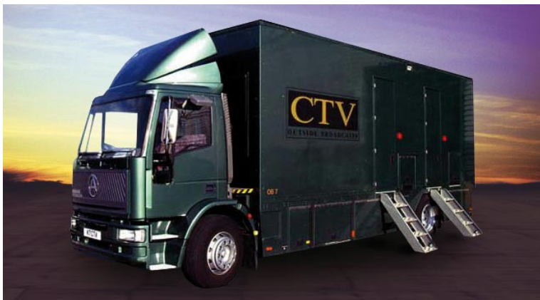
CTV OB 7 HD PHOTO AND MONITOR STACK

www.ctvob.co.uk tel +44 (0) 20 8453 8989 info@ctvob.co.uk